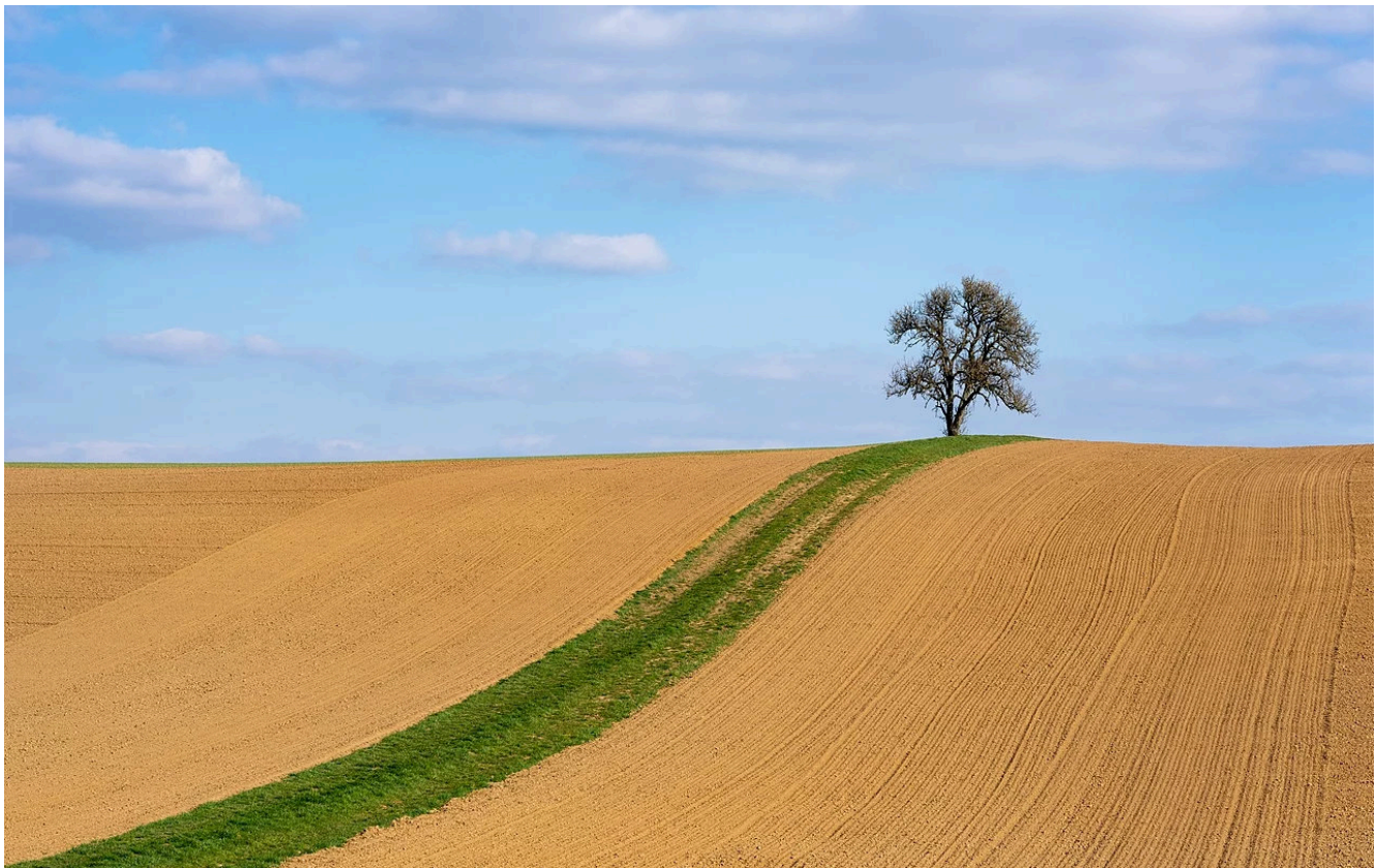
Photo 1: Neudenau , Germany, district Herbolzheim: sloping up bare fields, a track with green grass and a lonely pear tree near the Hohe Strasse southeast of Herbolzheim.

Donec tristique risus libero. Pellentesque lacinia ut orci non ornare. Etiam dapibus dui ut magna pellentesque consequat. In quam nisi, blandit in interdum ut, faucibus a quam. Orci varius natoque penatibus et magnis dis parturient montes, nascetur ridiculus mus. Donec aliquam scelerisque erat quis egestas. Cras pharetra imperdiet sodales. Sed rutrum ipsum aliquam nibh viverra ornare. Aliquam id nulla nec est lacinia malesuada id nec risus. Etiam aliquam ante hendrerit urna tincidunt eleifend. Aliquam erat volutpat. Donec consectetur sodales libero ac porta.