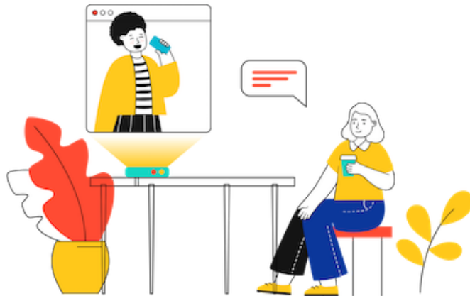
Image: blush.design All Illustrations published on Blush can be used for free. Licence.

Maecenas imperdiet tempus felis sed hendrerit. Etiam ornare placerat augue sit amet sollicitudin. Cras a posuere nibh. Aliquam lobortis imperdiet magna. Curabitur fermentum lacinia consectetur.